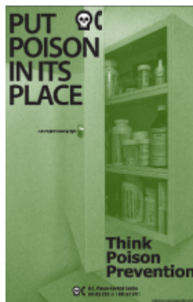
Medicine Cabinet Poster